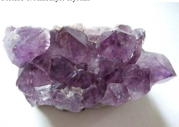
Picture 1. Amethyst crystals

Practical use: Small polished stones are inexpensive. Additionally, there are many pendants available on the market. Beautiful clusters of amethyst crystals can be used as the part of group or therapeutic community rites.